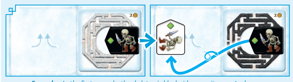
Examples: In the first example, the skeleton is black side up, so it cannot advance, because it is lost in a white labyrinth (the skeleton thus flips to its white side without moving). In the second example, the skeleton is black side up, so it can advance, because it is on a black labyrinth, so it immediately flips and is reoriented by a reorientation arrow.

This trap is indestructible, and remains in place, without flipping, until you retrieve it.