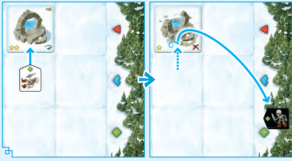
Example: A skeleton moves into your magic portal; it is immediately teleported to the corresponding forest on your board and flipped over. It does not advance again this round.

After the portal has been used, flip it to its Damaged side. If it was already damaged, remove it from the game after the skeleton movement phase.