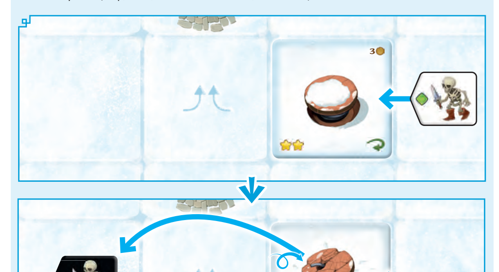
Example: The skeleton enters the space with the spring, and is thrown 2 spaces further in the same direction. The skeleton is flipped as usual. It is not affected by the reorientation arrows over which it was thrown.

They are never affected by the space over which they are tossed, even if that space is occupied by a trap, your tower, or your hero. On the other hand, they are affected by whatever is in the space where they land (trap, hero, reorientation arrow, treasure...).